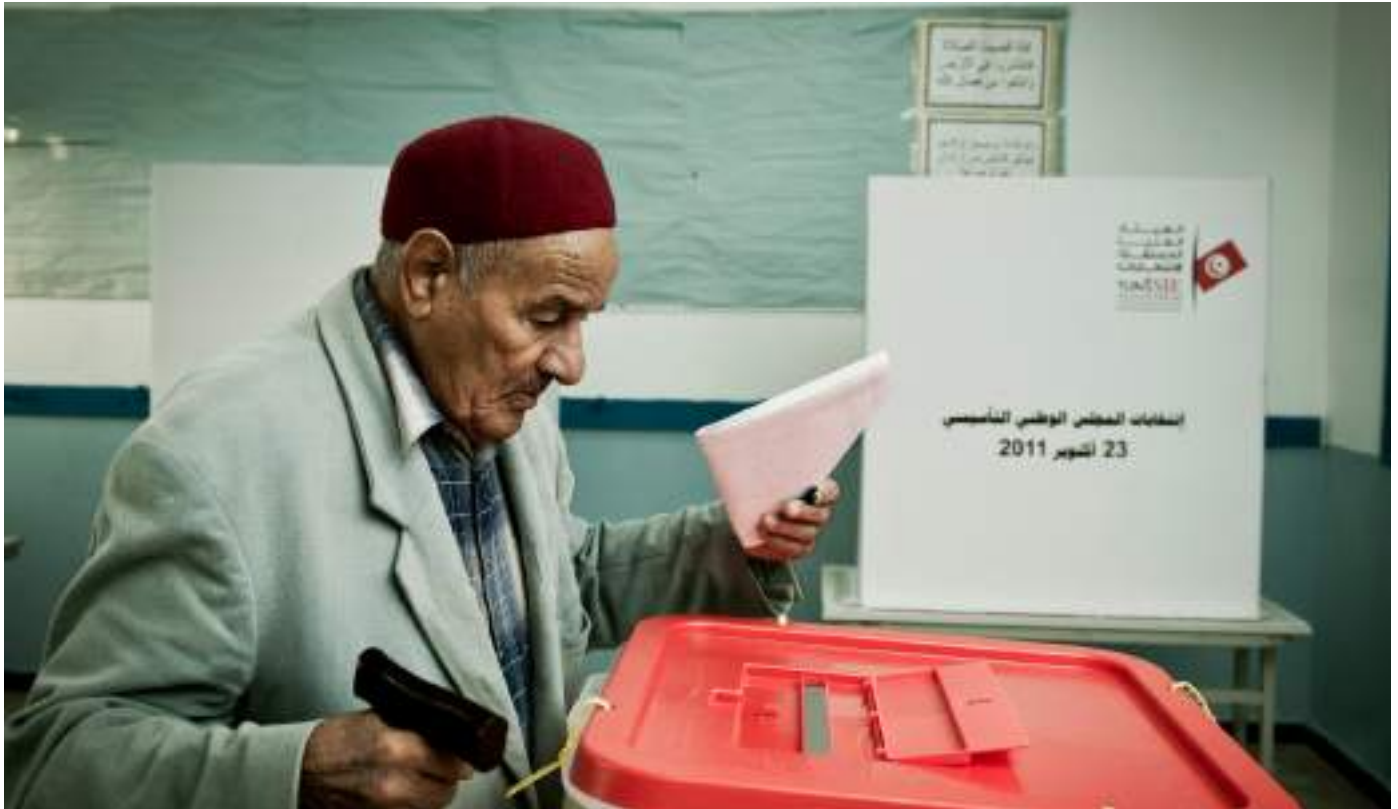
At the invitation of the Tunisian interim government, the European Union established an Election Observation Mission to monitor the elections for a Constituent Assembly, October 23, 2011.

their country from too much external interference by rejecting any role as a “model” for other Arab states, instead insisting on their own specificity. Tunisia’s military was not a political force under Ben Ali, and unlike Egypt’s military, it has embraced civilian control. Finally, while Tunisia has suffered some significant assassinations and terrorist attacks, it has not thus far become a concerted focus for regional jihadist efforts (although for reasons not fully understood, Tunisia has produced a disproportionately large number of ISIS recruits going to Syria).