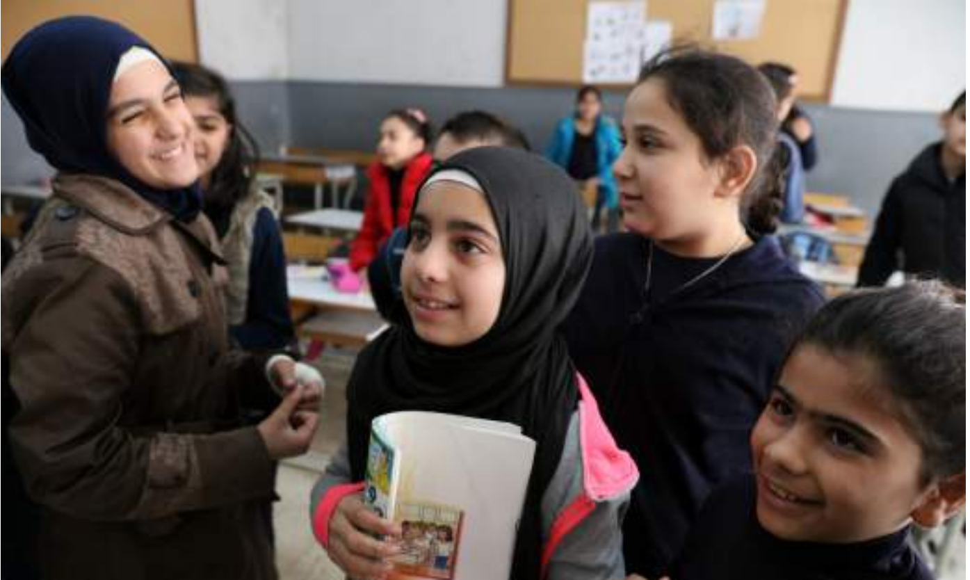
Students at the Second Bourj Hammoud Public School listen to their teacher while in class in Beirut, Lebanon on March 23, 2016.

renewed authoritarianism took hold, the United States largely acquiesced.