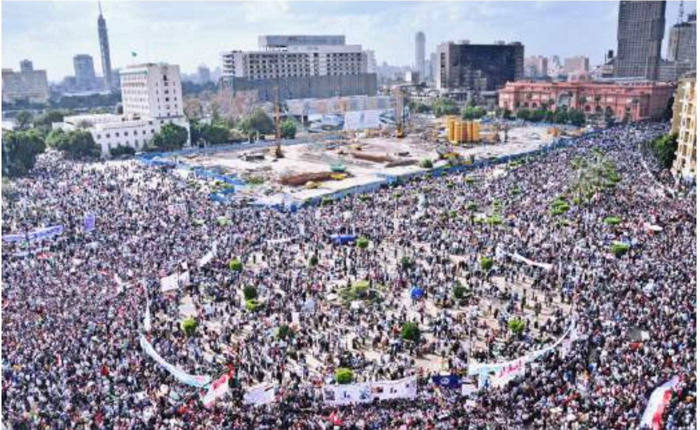
Protestors filled Tahrir Square in Cairo, Egypt on April 8, 2011.

The corporatist systems of Arab autocracy, sustained by rents, ideology, and occasional coercion, were challenged at the end of the twentieth century by the emergence of three major forces: a massive demographic bulge of young people on the cusp of adulthood; the push and pull of local economic stagnation and global economic integration; and a radically new information environment generated first by satellite television and then by the Internet and mobile technology. These forces, in combination, fatally undermined the ability of the region's governments to deploy ideology, rent-based patronage, and selective coercion to maintain consent for their rule.