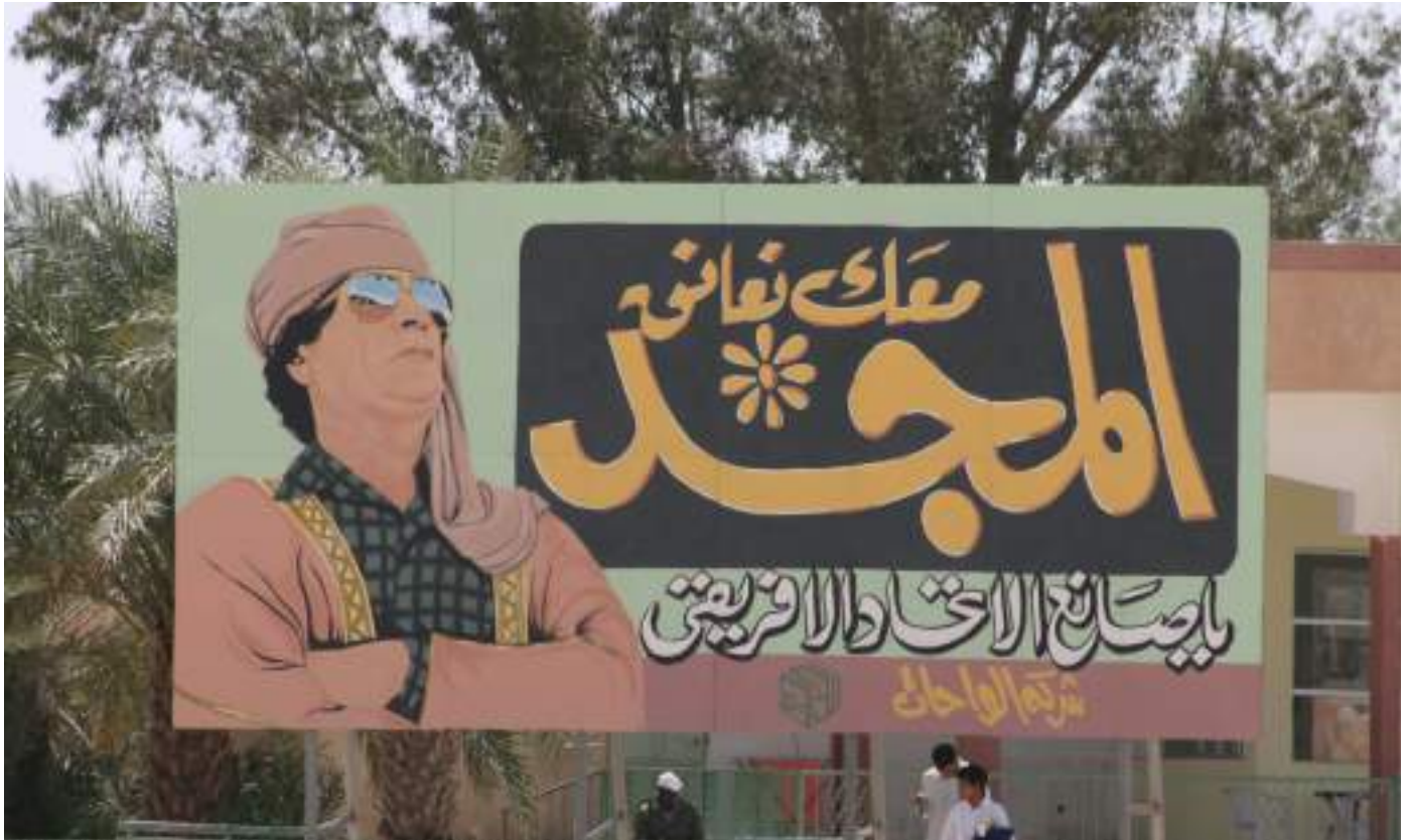
Propaganda for then-President Muammar al-Qaddafi in Derj, Libya, April 14, 2009.

outside actors as the best available means to shore up the region.