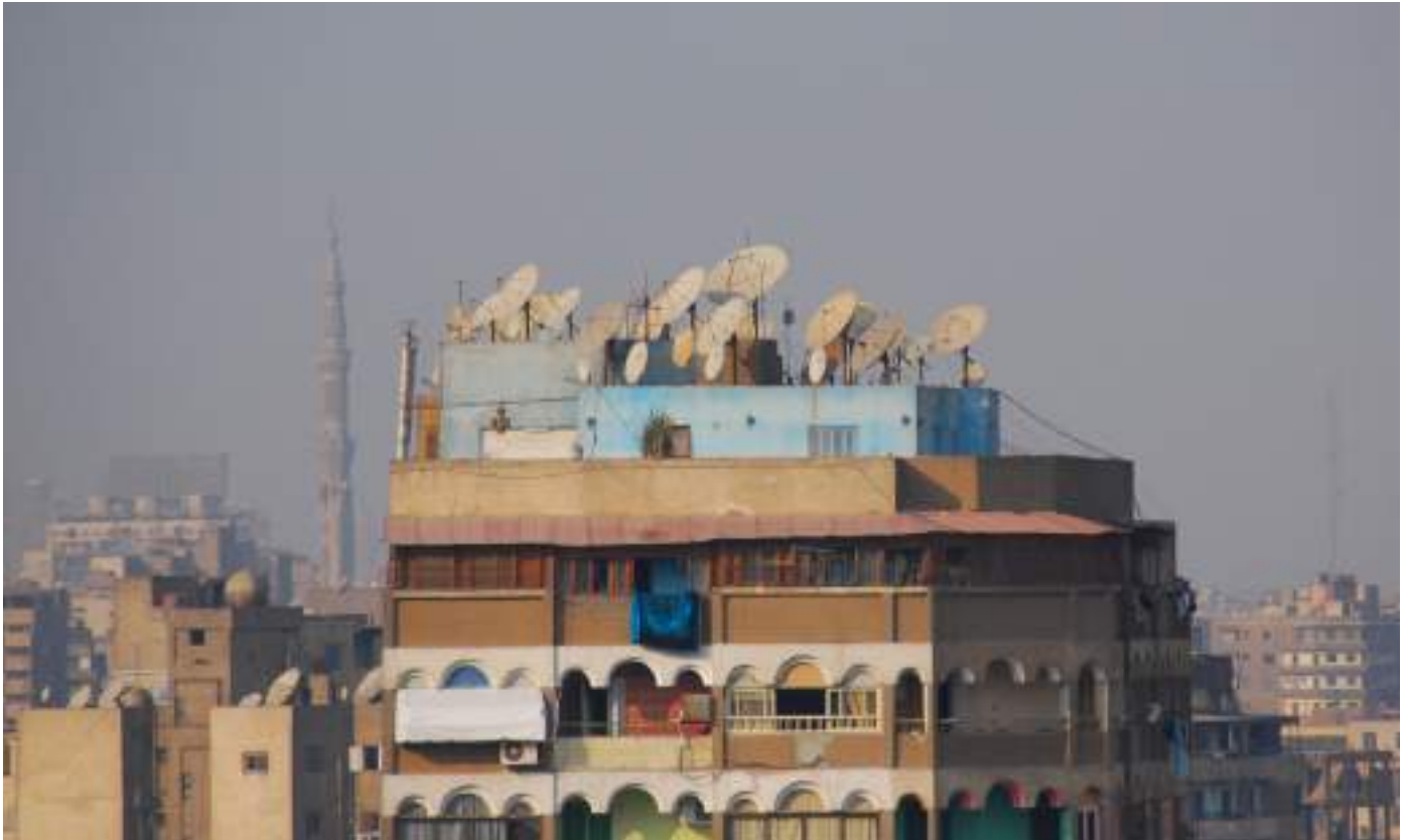
Satellite dishes on building roofs in Cairo, Egypt provided new access to information, December 27, 2007.

Perhaps it was inevitable that in this context of limited political and economic reforms determined by, and largely benefiting, a narrow slice of the society, the Arab world would see the emergence of new forms of bottom-up formal and informal political mobilization in the form of grassroots protest movements, new labor unions and wildcat labor actions, and new political parties, as well as new mobilization within and recruitment to long-standing non-state movements like the Muslim Brotherhood and Salafi groups.