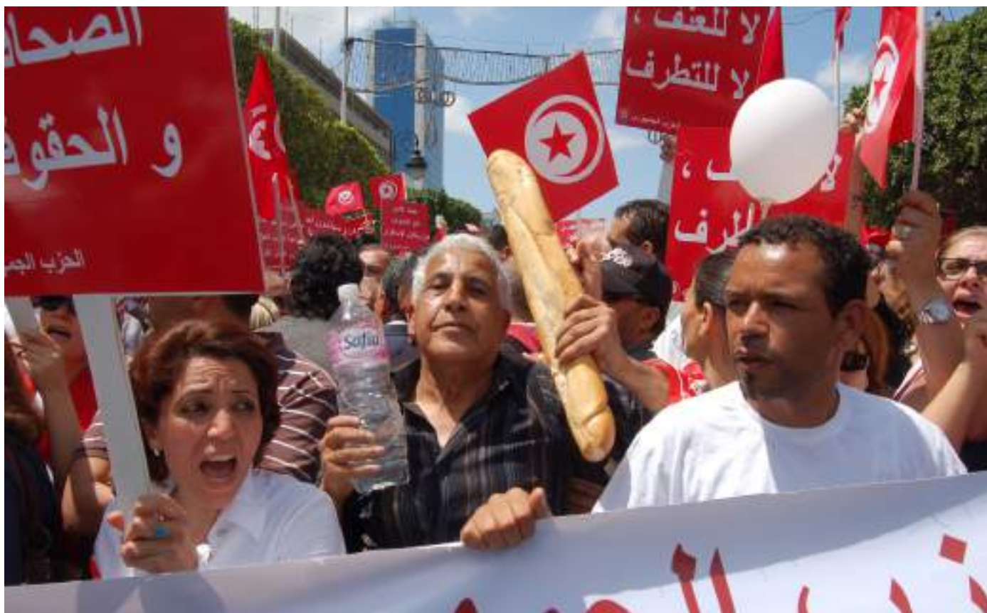
First of May protest in Tunis, Tunisia, 2012.

finding fodder for damaging accusations, or to prevent political opponents from gaining a foothold. Such constraints on information hold back social trust and progress in general, but are even more pernicious in the current disordered environment. Government opacity breeds suspicion and cynicism about government behavior, exacerbating the problems of order and authority that are already challenging governance. Sustainable governance requires regimes to adjust to the reality of an information environment they cannot control, listen to public demands for participation, and abide by the demand for accountability. Durable governments will proactively open themselves to public scrutiny, as well as to public input and assessment of their performance; while this may increase complaints and demands, it also spurs more responsive and effective policies and practices.