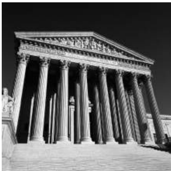
Fig. 6.1 The Supreme Court of US